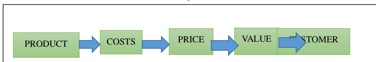
Figure 1 Cost-Based Pricing Procedures

Cost-based pricing method is also not fair for customer because if a company produce their product inefficiently, the customer has to pay the un-efficiency impact on costs. This approach also does not consider demand, supply, competition and new entrance.